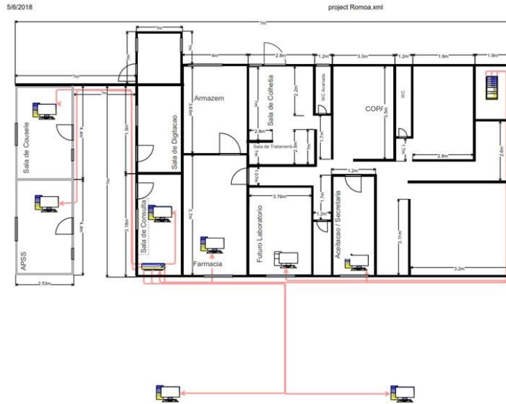
First draft IT network of CS Romão (during Readiness Assessment)