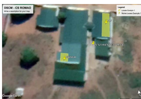
Aerial photo of CS Romão during Readiness Assessment